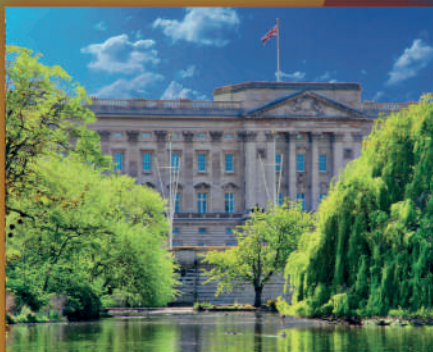
Investiture Orchestra of the Household Division