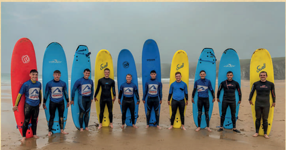
Number 7 Company adventure training in Cornwall

Number 7 Company receives Guardsmen fresh from the Infantry Training Centre, Catterick, where they learn their core infantry skills before serving with the Coldstream Guards. All of the Guardsmen in the Guard of Honour are qualified infantrymen but also take a huge amount of pride in the roles they carry out at Royal Palaces and London.