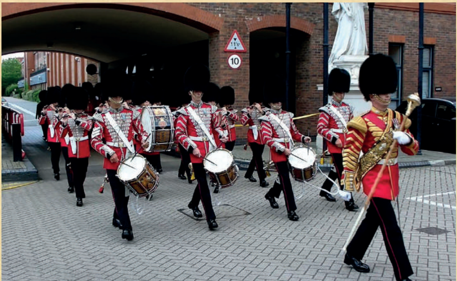
The Corps of Drums departing Victoria Barracks, Windsor