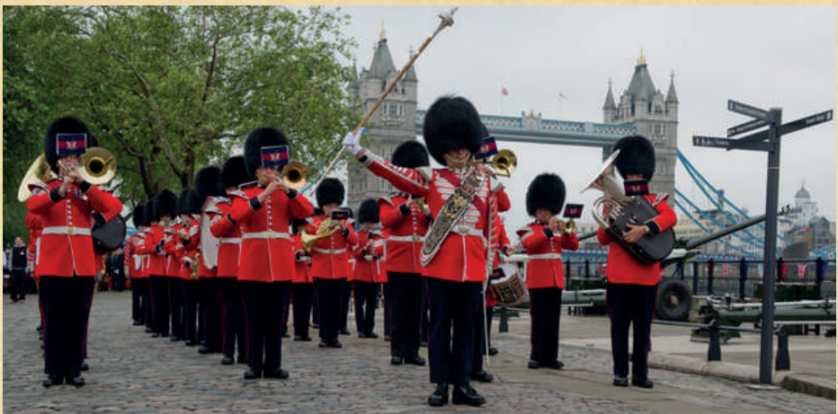
Honourable Artillery Company Band, Tower of London