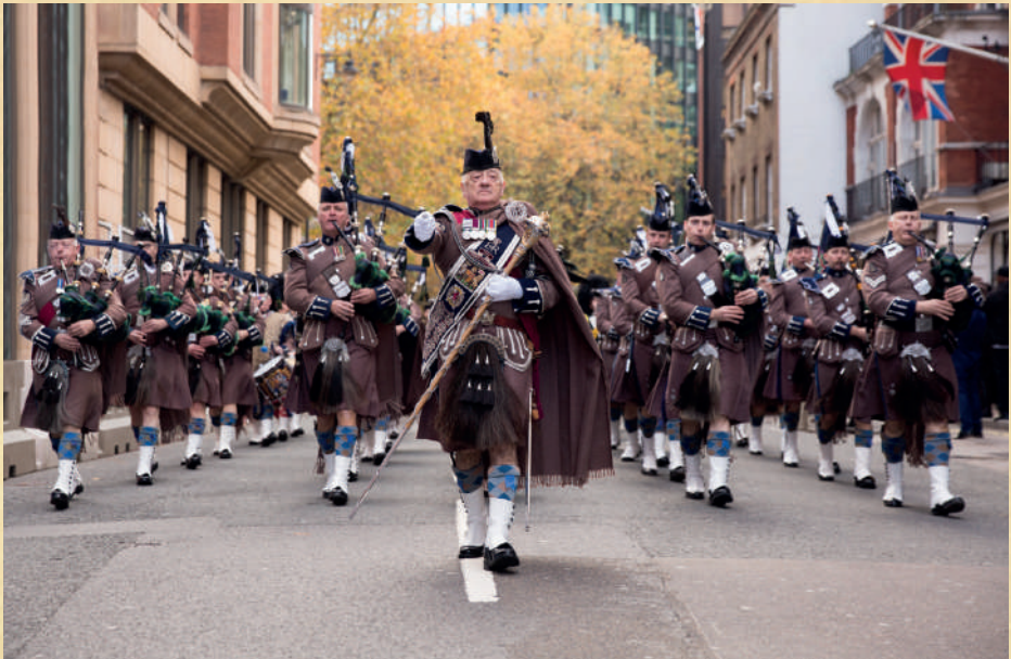
The Pipes & Drums on parade at the Lord Mayor’s Show.

The Pipes and Drums have performed all over the world, including locations as diverse as Uzbekistan, Italy, Poland, Germany and Spain. They can be found proudly leading The London Regiment, the Guards reserve battalion, on many London parades and events such as the annual Lord Mayor’s Show.