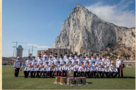
The Band of The Royal Yeomanry, Gibraltar

Throughout the last year, the HAC has provided musical support to VE and VJ national commemorations. A socially distanced camp at Longmoor kept the musicians 'fighting fit' before the most recent lockdown period to ensure Guards' Chapel services and Tower of London Bugler duties at the 'Ceremony of the Keys' were still able to happen.