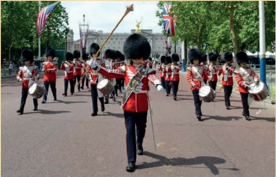
Honourable Artillery Company Corps of Drums, The Mall