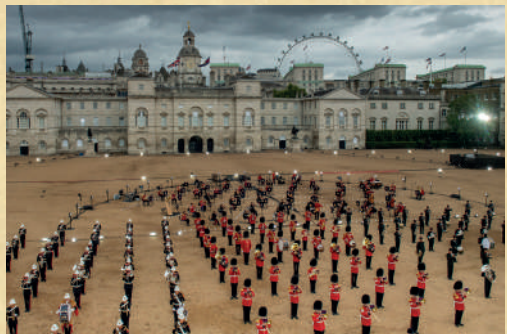
Victory in Japan Day Parade, Horse Guards 2021

In December 2020, the Band of the Grenadier Guards were seen at the 193rd Sovereign's Parade at The Royal Military Academy, Sandhurst. Unbeknown to most, it was a special occasion for the Band as one former